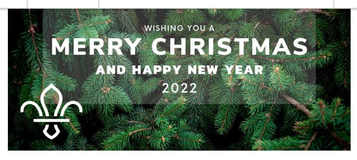
Copyright © 2021 12th Aylesbury Scouts, All rights reserved.